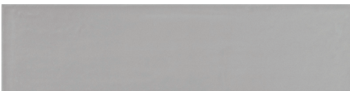
Smooth Tin Matte