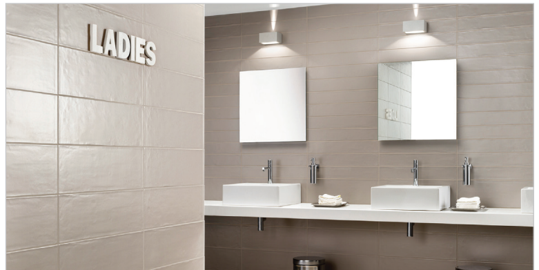
Smooth Sand Matte 4 × 24 & 8 × 24

The Smooth Series is an Italian made white body ceramic wall tile and offers a wide array of neutral and smoky color hues. The research and development that led to the creation of this color palette is apparent. Due to its breadth of color offerings, this series can be used in combination with natural stone or other tile series, including glass tile. It is available in five colors, with White offered in both the glossy and matte finishes.