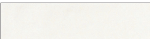
Smooth White Glossy & Matte