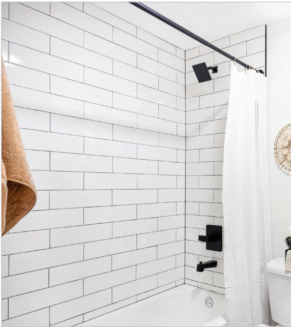
Smooth White Glossy 4 × 24