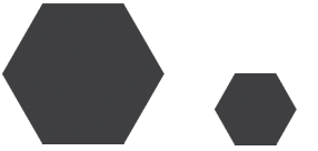
Hex 14 × 16 Hex 8-1/2 × 10