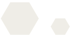
Hex 14 × 16 Hex 8-1/2 × 10