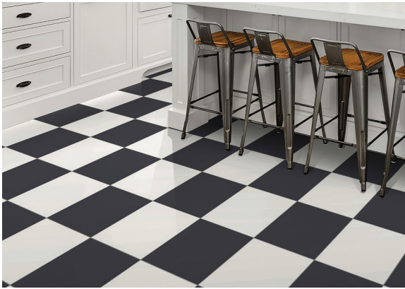
Paros 12 × 12 Black & White