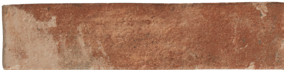
Castle Brick Multi