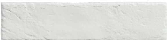
Castle Brick White