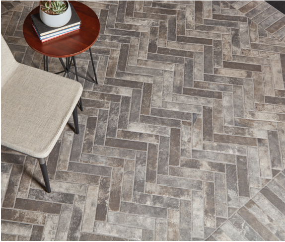
Castle Brick Grey