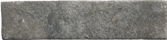
Castle Brick Grey