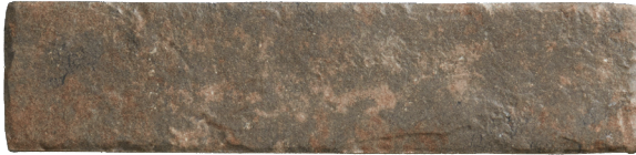
Castle Brick Brown