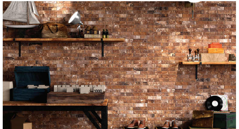
Castle Brick Red

Piece to piece variation in shade or color are inherent in all fire clay products; therefore it is recommended to mix tiles from several boxes at a time during installation to achieve the best range of color. This series is suitable for residential and commercial applications.