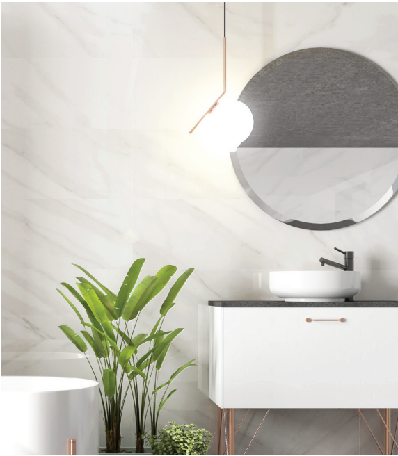
Cala Lenci Polished 12 x 24