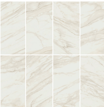
Cala Tresana Polished