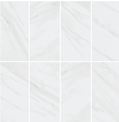
Cala Lenci Polished