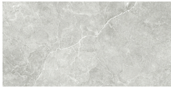
12 × 24