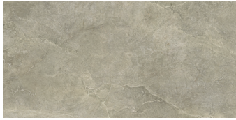
12 × 24