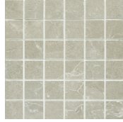
2 × 2 Mosaic Mesh