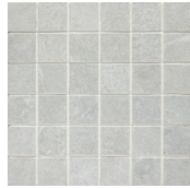
2 × 2 Mosaic Mesh