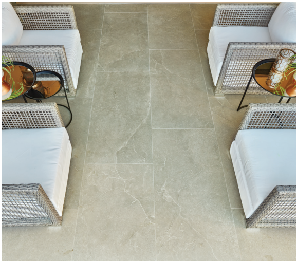
Unica Desert 24 × 48 R11 Anti-Slip Finish