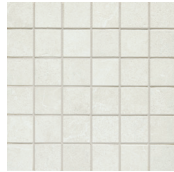
2 × 2 Mosaic Mesh