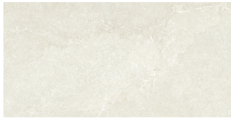
12 × 24