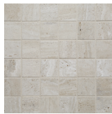
2 x 2 Mosaic Mesh