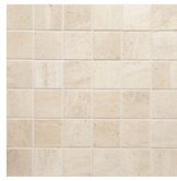
2 x 2 Mosaic Mesh