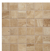
2 x 2 Mosaic Mesh