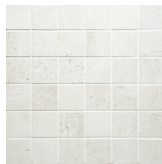
2 x 2 Mosaic Mesh