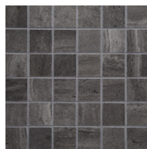
2 x 2 Mosaic Mesh