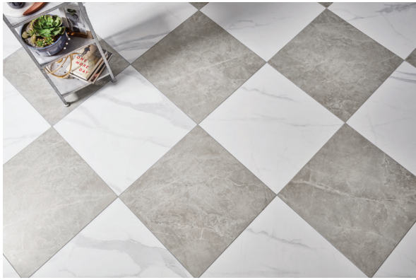
Themar Grigio Savoia & Statuario V