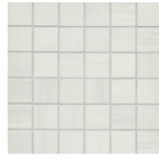
2 x 2