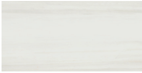
12 x 24