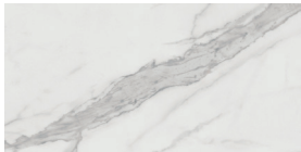
12 x 24