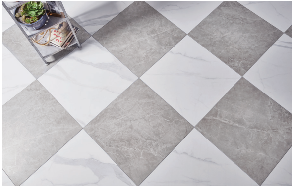
Themar Grigio Savoia & Statuario V