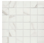
2 x 2