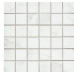
2 x 2