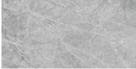
12 x 24