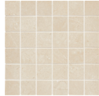
2 x 2