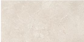
12 x 24