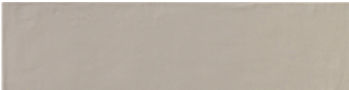
Smooth Sand Matte