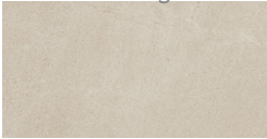
12 × 24