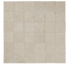
2 × 2 Mosaic