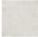
2 × 2 Mosaic