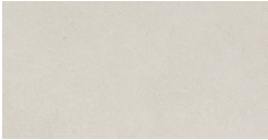
12 × 24