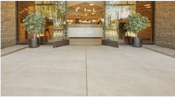
Pietra Italia Beige 24 × 48 R11 Anti-Slip Finish