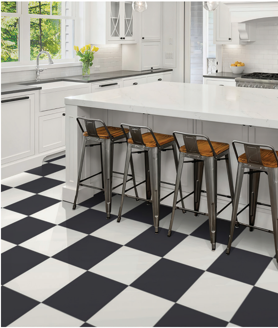
Paros 12 × 12 Black & White