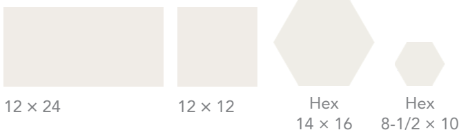
12 × 24 12 × 12 Hex 14 × 16 Hex 8-1/2 × 10