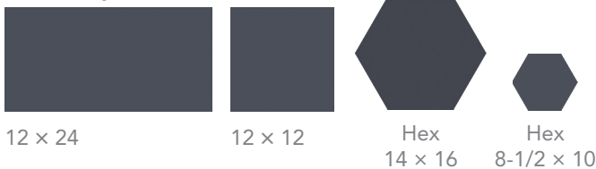
12 × 24 12 × 12 Hex 14 × 16 Hex 8-1/2 × 10