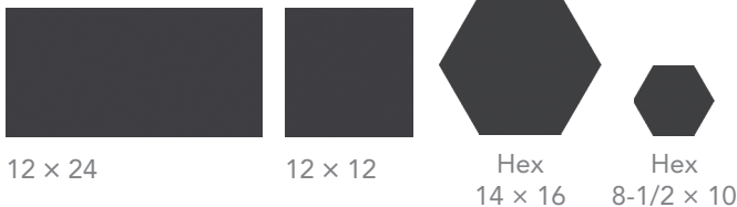
12 × 24 12 × 12 Hex 14 × 16 Hex 8-1/2 × 10