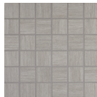
2 x 2 Mosaic Mesh