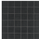
2 x 2 Mosaic Mesh