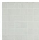
2 x 2 Mosaic Mesh

Metalwood is a product line that is specifically designed for commercial applications. It is available in a number of colors and sizes. The Metalwood series is suitable for both dry and wet or humid rooms. It is great for all applications, from the most original building of modern architecture to the restoration of classic buildings. Casalgrande Padana Metalwood is ideal for high traffic applications and can withstand significant physical-chemical stress.