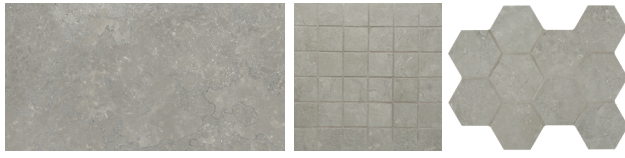
Lagos Concrete 2 x 2 Mosaic 4 Inch Hex