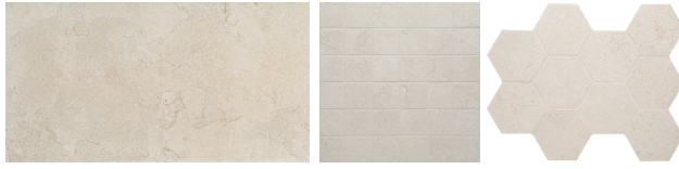
Lagos Ivory 2 x 2 Mosaic 4 Inch Hex