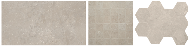
Lagos Sand 2 x 2 Mosaic 4 Inch Hex