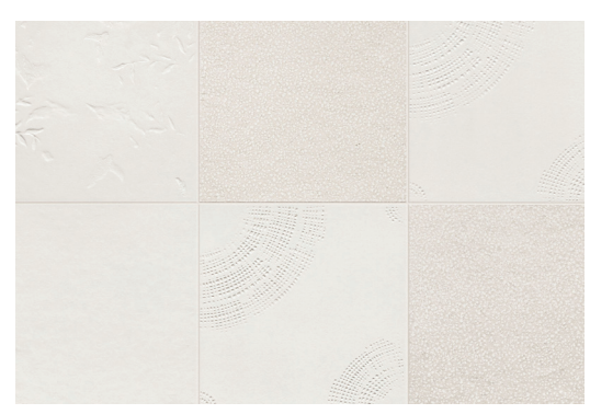
Chymia Mix 1 White