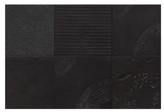
Chymia Mix 1 Black