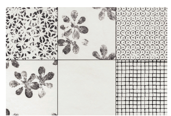
Chymia Mix 2 White