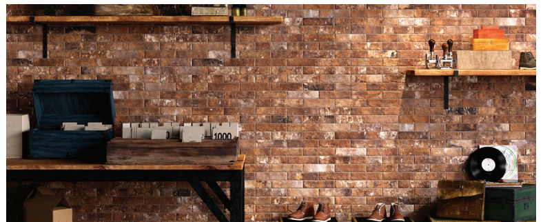
Castle Brick Red

Piece to piece variation in shade or color are inherent in all fire clay products; therefore it is recommended to mix tiles from several boxes at a time during installation to achieve the best range of color. This series is suitable for residential and commercial applications.