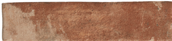
Castle Brick Multi