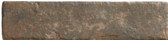
Castle Brick Brown