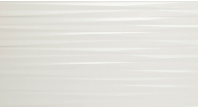
3D White Blade Matte