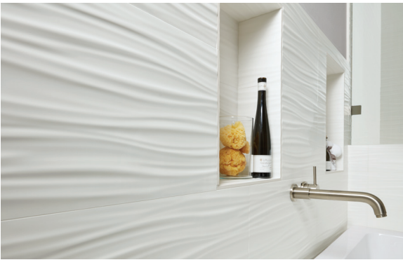
3D White Ribbon Matte