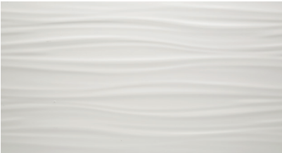
3D White Ribbon Matte