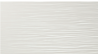
3D White Wave Matte

For packaging information, please contact your local Arizona Tile.