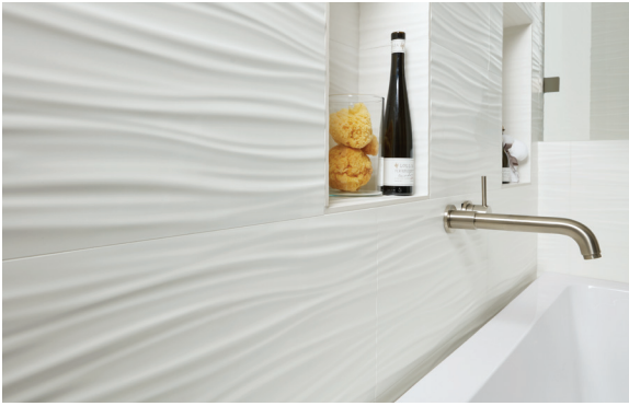
3D White Ribbon Matte