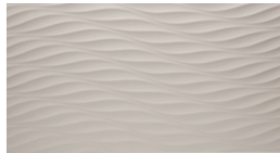
3D Grey Twist Matte