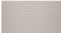
3D Grey Wave Matte