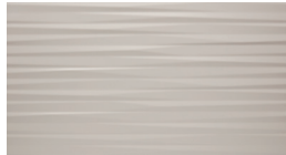
3D Grey Blade Matte