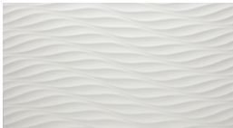
3D White Twist Matte