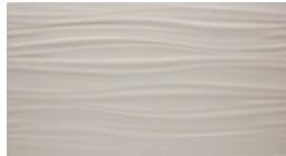
3D Grey Ribbon Matte