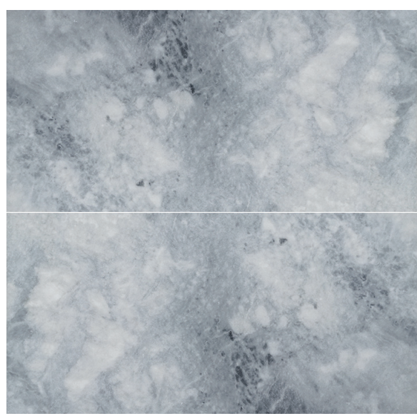
12 \times 24 \times 3/8