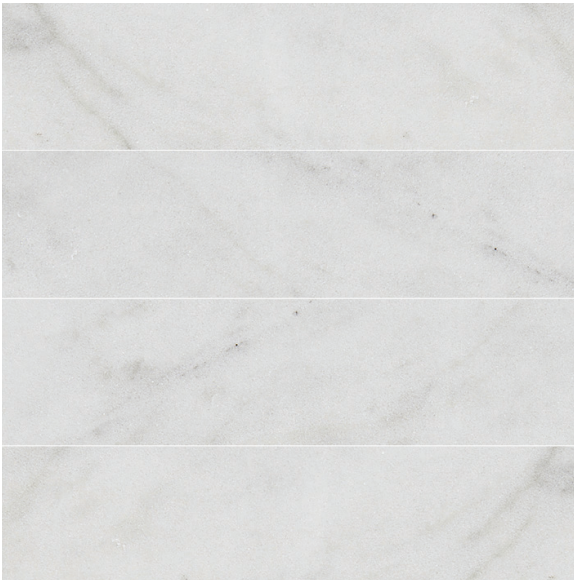
4 × 16 × 3/8