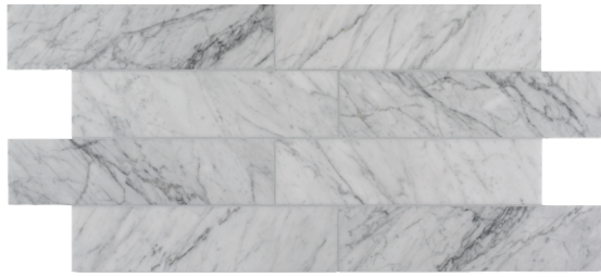
4 × 16 × 3/8 (H & P)