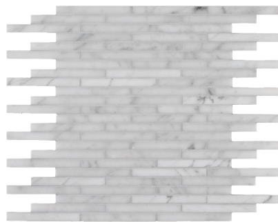
Mini Brick Mesh (H & P)