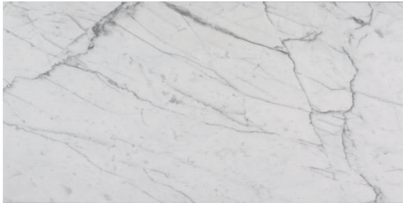
12 × 24 × 3/8 (H & P)