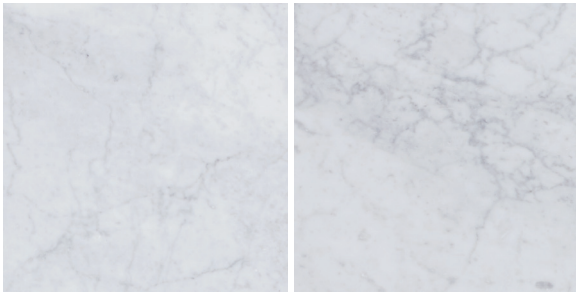
12 x 12 x 3/8 (H & P)