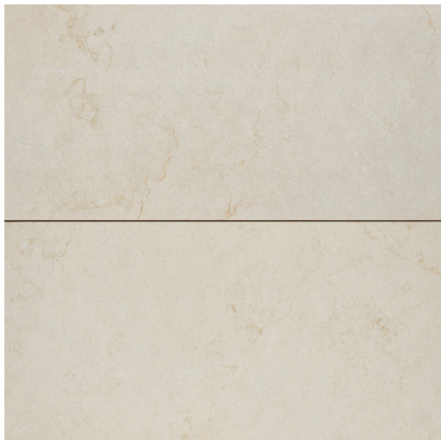
18 × 36 × 3/8