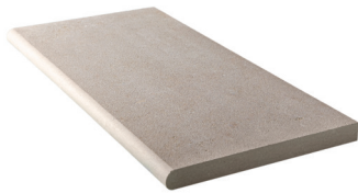
12 × 24 × 1-1/4 Pool Coping