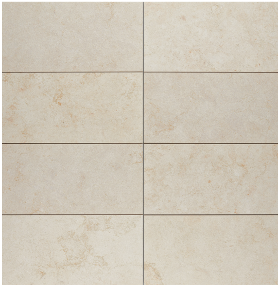
12 × 24 × 3/8