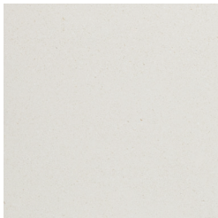
Honed 18 × 18