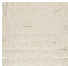
Split 4 × 16 (4pcs)