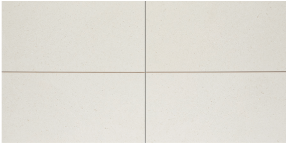
Honed 12 × 24