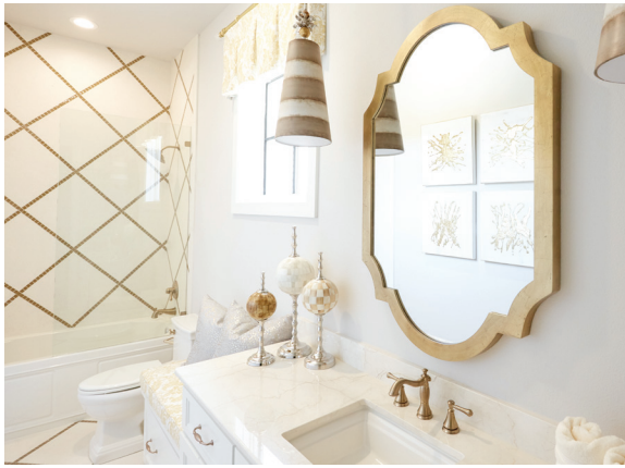
Honed 18 × 18