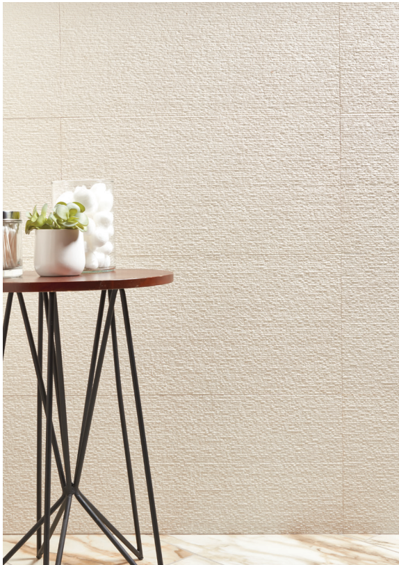
Combed 12 × 24