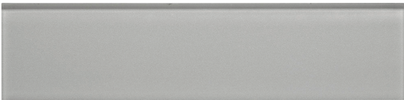
Dunes Denim Flat