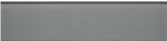
Dunes Platinum Flat