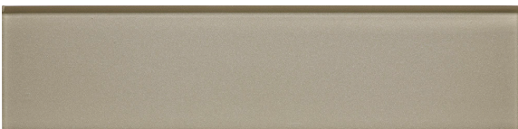
Dunes Sand Flat