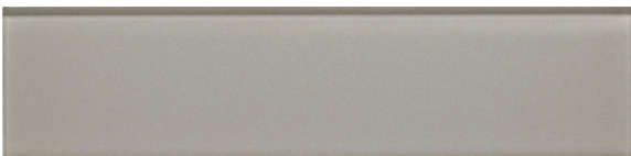
Dunes Pewter Flat