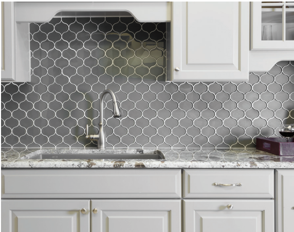
Dunes Platinum Arabesque