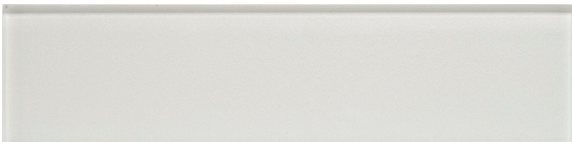
Dunes Pearl Flat