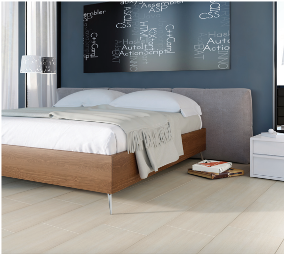
Shen White Shades