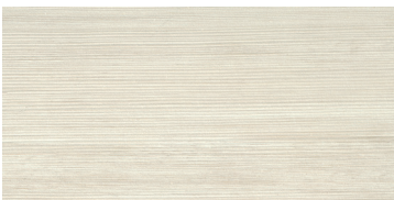
Shen White Shades