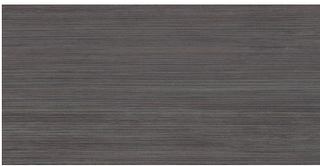
Shen Balance Grey

Bamboo 12 × 24 Natural 12 × 24 All colors 24 × 48