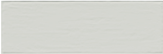
Pastel Ivory Matte