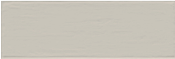
Pastel Beige Matte