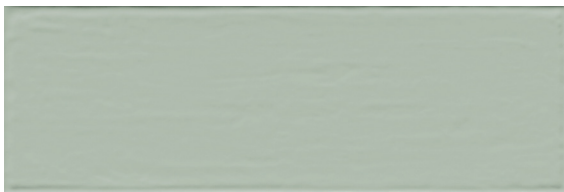
Pastel Sage Matte