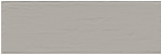
Pastel Greige Matte