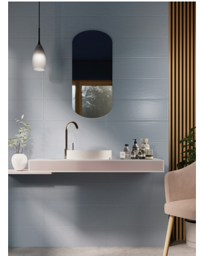
Pastel Denim Matte

Commercial Residential Interior Wall Fireplaces Shower Walls