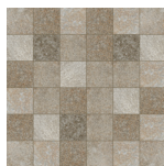
2 x 2 Mosaic Mesh

When installing rectangular or square tiles 15 inches or longer with a staggered joint, it is recommended that the offset should not exceed 33%, unless otherwise specified by the manufacturer.