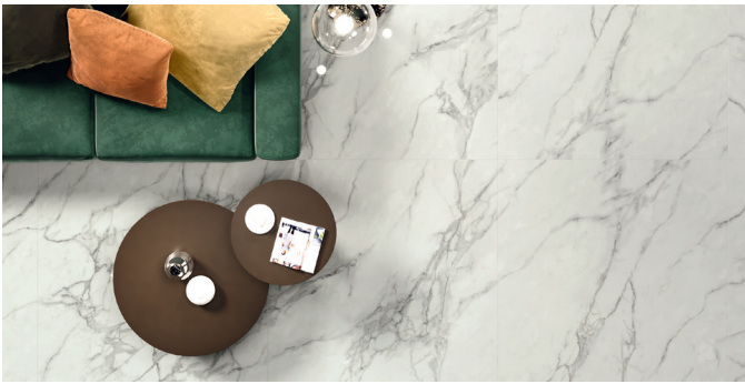
Marvel Calacatta Prestigio Polished