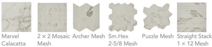
Marvel Calacatta Extra 2 x 2 Mosaic Mesh Archer Mesh Sm.Hex 2-5/8 Mesh Puzzle Mesh Straight Stack 1 x 12 Mesh