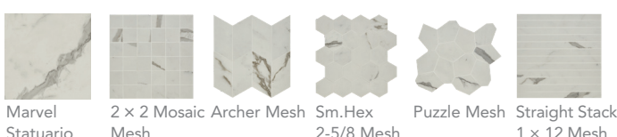
Marvel Statuario Supremo 2 x 2 Mosaic Mesh Archer Mesh Sm.Hex 2-5/8 Mesh Puzzle Mesh Straight Stack 1 x 12 Mesh

When installing rectangular or square tiles 15 inches or longer with a staggered joint, it is recommended that the offset should not exceed 33%, unless otherwise specified by the manufacturer.