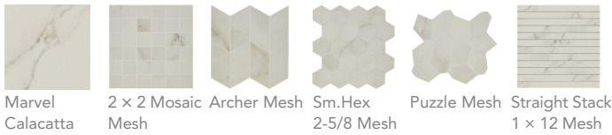
Marvel Calacatta Apuano 2 x 2 Mosaic Mesh Archer Mesh Sm.Hex 2-5/8 Mesh Puzzle Mesh Straight Stack 1 x 12 Mesh