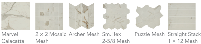
Marvel Calacatta Prestigio 2 x 2 Mosaic Mesh Archer Mesh Sm.Hex 2-5/8 Mesh Puzzle Mesh Straight Stack 1 x 12 Mesh