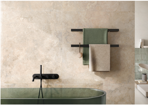
Invictus Cross Cut Beige