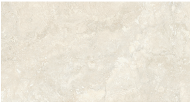
Invictus Ivory Cross Cut