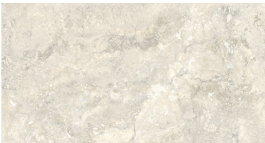
Invictus Pearl Cross Cut