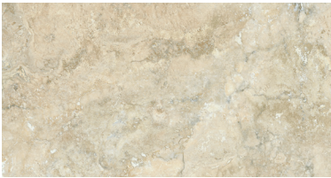
Invictus Beige Cross Cut