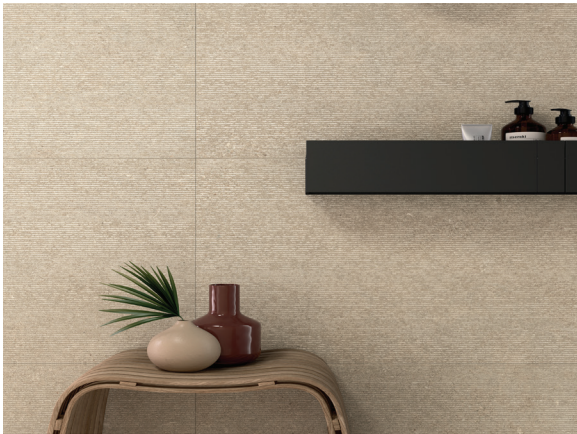
Intense Beige Trait 24 x 48