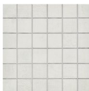
2 × 2 Mosaic Mesh

When installing rectangular or square tiles 15 inches or longer with a staggered joint, it is recommended that the offset should not exceed 33%, unless otherwise specified by the manufacturer.