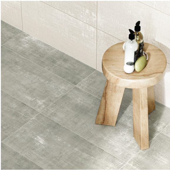
Fray Metal Gray (floor) & Fray Metal White (wall)