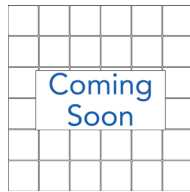
2 × 2 Mosaic Mesh