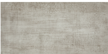
Fray Metal Gray