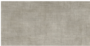
Fray Metal Gray