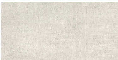
Fray Metal White