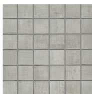
2 × 2 Mosaic Mesh