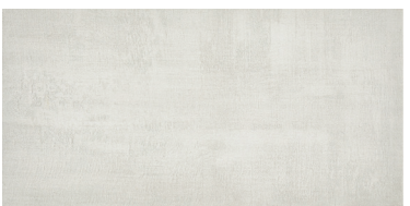
Fray Metal White