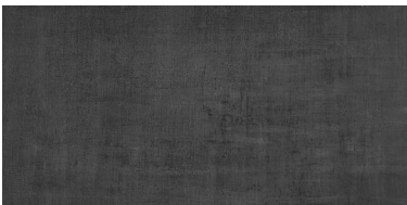
Fray Metal Black

For proper bonding, LFT/LHT mortar for large format and heavy tiles should be used when installing tiles with a dimensional length greater than 15 inches, and rectangular shape and plank tile, per industry standards. Proper thinset coverage is also necessary, and in some cases, back buttering of tile may be required.