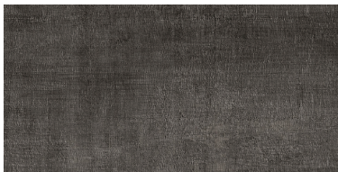
Fray Metal Black