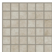
2 x 2 Mosaic Mesh