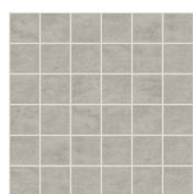
2 x 2 Mosaic Mesh