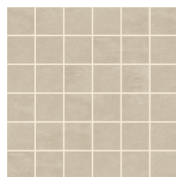
2 x 2 Mosaic Mesh