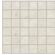
2 x 2 Mosaic Mesh