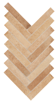
1 × 6 Herringbone Mesh (0.7640 sf/sht)