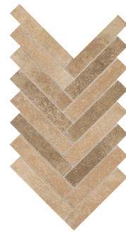
1 × 6 Herringbone Mesh (0.7640 sf/sht)