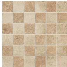
2 × 2 Mosaic Mesh (0.9684 sf/sht)