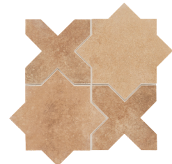
6" Star Cross Mesh (0.9684 sf/sht)