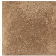
12 × 12