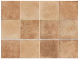
12 × 12 (12pcs)