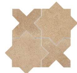
6" Star Cross Mesh (0.9684 sf/sht)