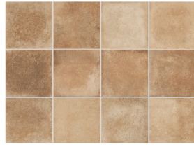
12 × 12 (12pcs)