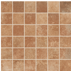
2 × 2 Mosaic Mesh (0.9684 sf/sht)