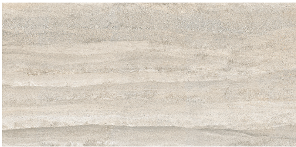
Compatta Pisé Sabbia