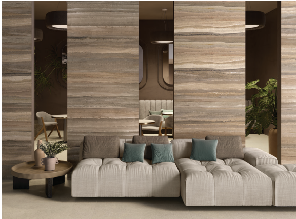
Compatta Pisé Melange