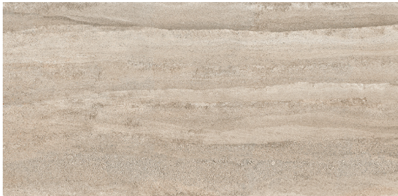
Compatta Pisé Limo