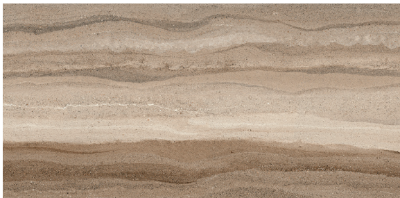
Compatta Pisé Melange