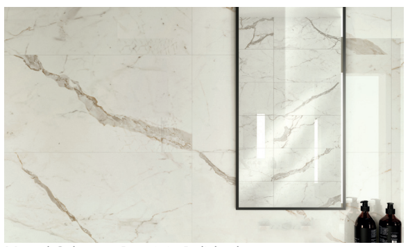
Marvel Calacatta Prestigio Polished