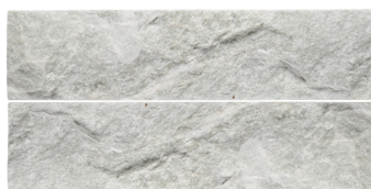
Split 4 × 16