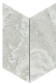
Honed Large Chevron Mesh (0.538 sf/sheet)