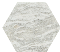
Satin 8" Hex (0.3849 sf/pc)