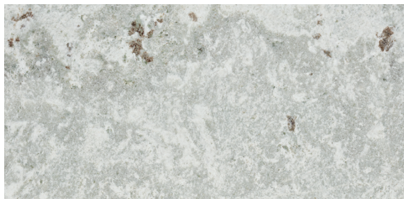
Satin 12 × 24