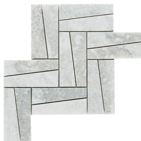
Multi Finish Modella Mesh (0.9802 sf/sheet)