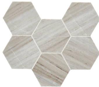
CS-Skyline Honed Hex 4 Inch Mesh (0.5595 sf/sht)