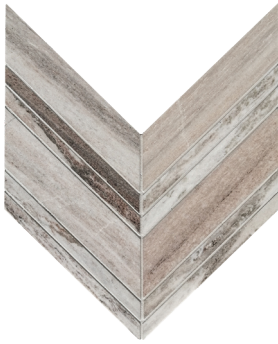
CS-Skyline Honed Chevron Mesh (0.7876 sf/sht)