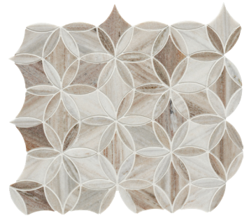
CS-Skyline Honed Flower Mesh (1.076 sf/sht)