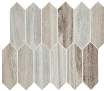
CS-Skyline Honed Picket Mesh (0.8369 sf/sht)