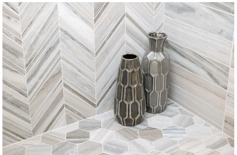
CS-Skyline Honed Chevron Mesh, Hex 4 Inch Mesh & 4 x 16

CS-Skyline Honed Chevron Mesh CS-Skyline Honed Ellipse Mesh CS-Skyline Honed Feather Mesh CS-Skyline Honed Flower Mesh CS-Skyline Honed Herringbone Mesh 1 x 4 CS-Skyline Honed Hex 4 Inch Mesh CS-Skyline Honed Lotus Mesh CS-Skyline Multi Finish 2 x 2 Hex Mesh CS-Skyline Honed Oval Mesh CS-Skyline Honed Penny Round 3/4 Mesh CS-Skyline Honed Picket Mesh CS-Skyline Honed Rhomboid Mesh CS-Skyline Honed Ribbon Mesh