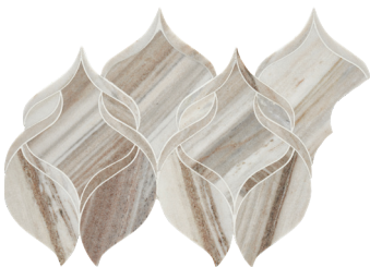
CS-Skyline Honed Ribbon Mesh (0.850 sf/sht)