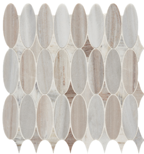
CS-Skyline Honed Oval Mesh (1.020 sf/sht)