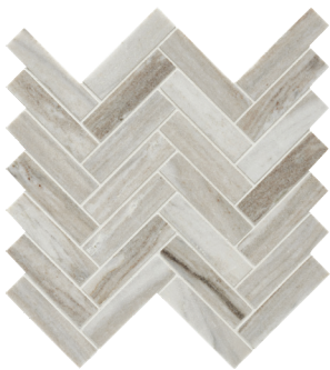
CS-Skyline Honed Herringbone Mesh 1 x 4 (0.8581 sf/sht)