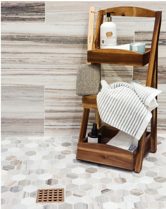
CS-Skyline Multi Finish 2 x 2 Hex Mesh & Honed 12 x 24

The Completa Series (CS) is a collection of natural stone tile, trim and mesh mount designs offered in six color collections each with 12 or more mesh mount variations. Each mosaic variation is artistically crafted with exclusive materials strategically arranged to display the material in unique and breathtaking designs. Shown here is CS-Skyline which is a warm toned marble with linear variations of cream, taupe and brown throughout. Its striking color variations add visual interest while remaining neutral enough to be used in a variety of designs. A mesh backing is adhered to the back of each decorative mesh mount product. Because this series is comprised of natural stone, there will be noticeable variations in color and movement between pieces. Therefore, it is important and recommended that a range of this product be viewed before finalizing a purchase. Piece to piece variation in shade or color are inherent in all natural stone products; therefore, when installing natural stone tile, it is recommended to mix tiles from several boxes at a time during installation to achieve the best range of color. As natural stone products, it is recommended that these be sealed to extend their longevity. When installing any of the options with white stone, you must use a white thinset. Using a grey thinset will leave trowel lines and could stain the stone.