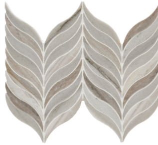
CS-Skyline Honed Feather Mesh (0.639 sf/sht)