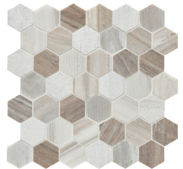
CS-Skyline Multi Finish 2 x 2 Hex Mesh (0.975 sf/sht)