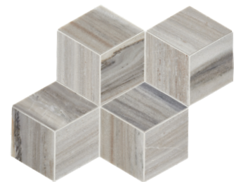
CS-Skyline Honed Rhomboid Mesh (0.870 sf/sht)