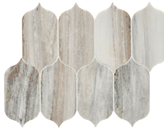
CS-Skyline Honed Lotus Mesh (0.7548 sf/sht)