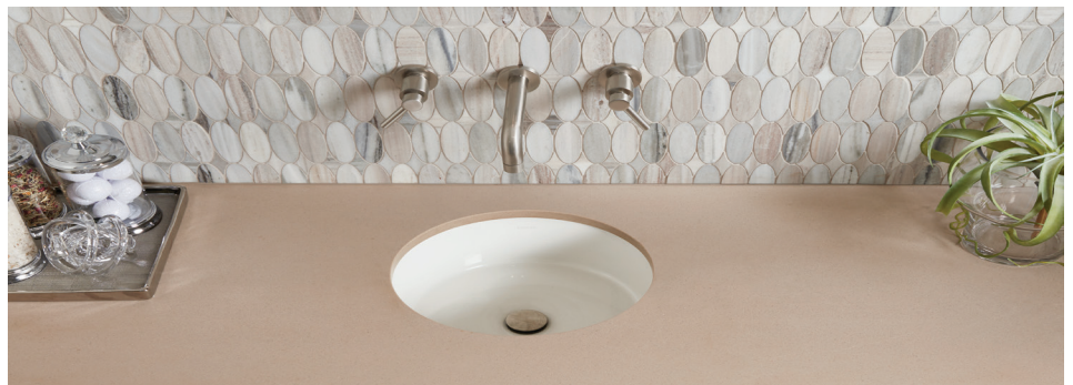
CS-Skyline Honed Oval Mesh