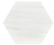
Honed 8" Hex (0.3849 sf/pc)