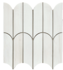
Honed Arch Mesh (0.9945 sf/sheet)