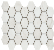
Multi Finish Hex Mesh (1.0297 sf/sheet)