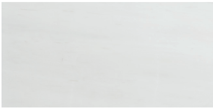
12 × 24 (H, P)