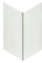
Honed Large Chevron Mesh (0.538 sf/sheet)