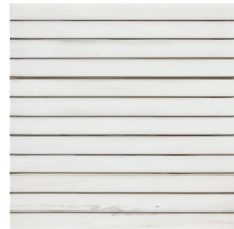
Honed 1 × 12 Straight Mesh (1 sf/sheet)