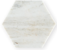
8 x 8 Hexagon