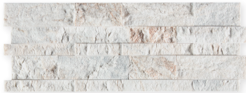
Split 3D Stack Mesh, 7-3/16 x 19-5/8 Mesh