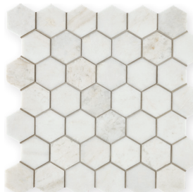
2 x 2 Hexagon Mesh