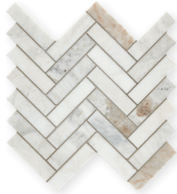
Herringbone 1 x 4 Mesh