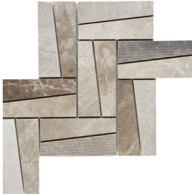
Multi Finish Modella Mesh (0.9802 sf/sheet)