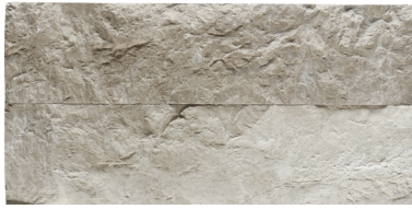
Split 4 × 16 (2 pcs shown above)