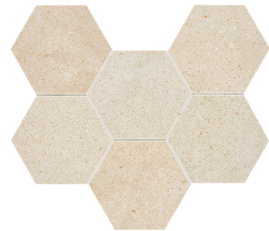
Honed 4" Hex Mesh (0.5391 sf/sht)