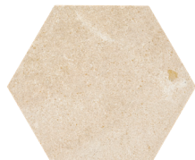
Honed 8" Hexagon (0.3841 sf/pc)