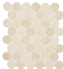
Honed Penny Round 2" Mesh (1.1287 sf/sht)