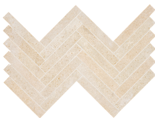
Honed Herringbone 1 × 6 Mesh (1.0510 sf/sht)