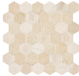
Multi Finish 2" Hex Mesh (0.9652 sf/sht)