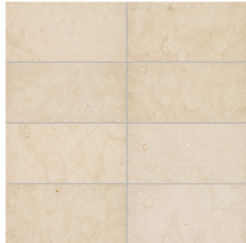
Honed 12 × 24 × 3/8 (8pcs)