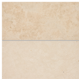
Honed 18 × 36 × 3/8 (2pcs)