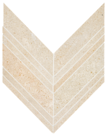
Honed Chevron Mesh (0.7823 sf/sht)