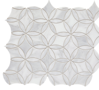
CS-Calacatta Gris Honed Flower Mesh