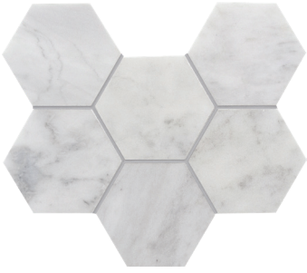
CS-Calacatta Gris Honed Hex 4 Inch Mesh