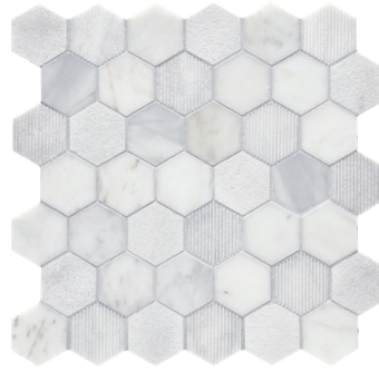
CS-Calacatta Gris Multi Finish 2 x 2 Hex Mesh