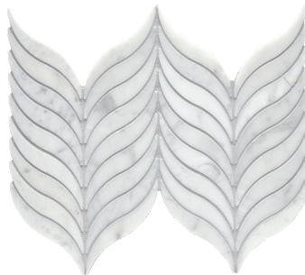
CS-Calacatta Gris Honed Feather Mesh