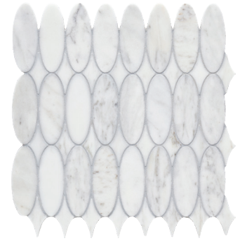
CS-Calacatta Gris Honed Oval Mesh