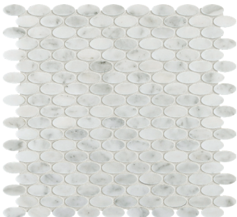
CS-Calacatta Gris Honed Ellipse Mesh

The Completa Series (CS) is a collection of natural stone tile, trim and mesh mount designs offered in six color collections each with 12 or more mesh mount variations. Each mosaic variation is artistically crafted with exclusive materials strategically arranged to display the material in unique and breathtaking designs. Shown here is CS-Calacatta Gris is a white marble with very faint, warm grey details dispersed throughout each piece. It is a white marble that compliments modern and traditional installations alike. A mesh backing is adhered to the back of each decorative mesh mount product. Because this series is comprised of natural stone, there will be noticeable variations in color and movement between pieces. Therefore, it is important and recommended that a range of this product be viewed before finalizing a purchase. Piece to piece variation in shade or color are inherent in all natural stone products; therefore, when installing natural stone tile, it is recommended to mix tiles from several boxes at a time during installation to achieve the best range of color. As natural stone products, it is recommended that these be sealed to extend their longevity. When installing any of the options with white stone, you must use a white thinset. Using a grey thinset will leave trowel lines and could stain the stone.