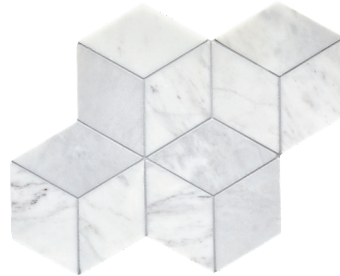
CS-Calacatta Gris Honed Rhomboid Mesh