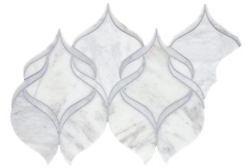
CS-Calacatta Gris Honed Ribbon Mesh