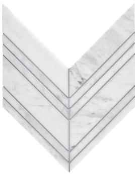
CS-Calacatta Gris Honed Chevron Mesh

The Completa Series (CS) is a collection of natural stone tile, trim and mesh mount designs offered in six color collections each with 12 or more mesh mount variations. Each mosaic variation is artistically crafted with exclusive materials strategically arranged to display the material in unique and breathtaking designs. Shown here is CS-Calacatta Gris is a white marble with very faint, warm grey details dispersed throughout each piece. It is a white marble that compliments modern and traditional installations alike. A mesh backing is adhered to the back of each decorative mesh mount product. Because this series is comprised of natural stone, there will be noticeable variations in color and movement between pieces. Therefore, it is important and recommended that a range of this product be viewed before finalizing a purchase. Piece to piece variation in shade or color are inherent in all natural stone products; therefore, when installing natural stone tile, it is recommended to mix tiles from several boxes at a time during installation to achieve the best range of color. As natural stone products, it is recommended that these be sealed to extend their longevity. When installing any of the options with white stone, you must use a white thinset. Using a grey thinset will leave trowel lines and could stain the stone.