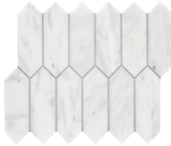
CS-Calacatta Gris Honed Picket Mesh