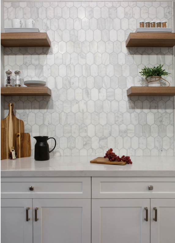
CS-Calacatta Gris Honed Lotus Mesh