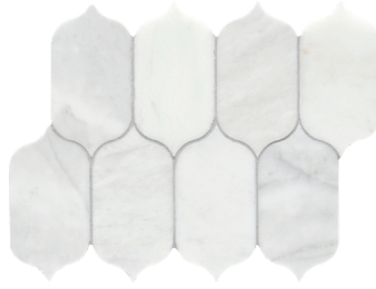
CS-Calacatta Gris Honed Lotus Mesh