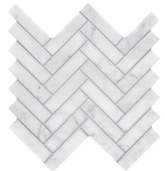
CS-Calacatta Gris Honed Herringbone Mesh 1 x 4