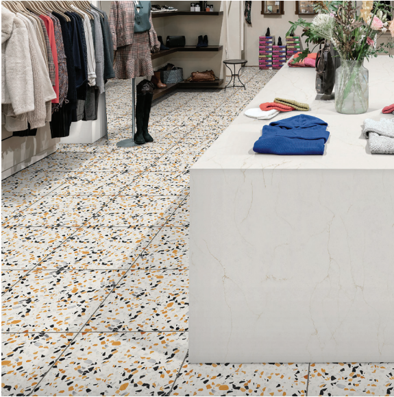
Regium 24 x 24 x 1/2