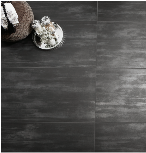
Reflexion Bright & Titanium