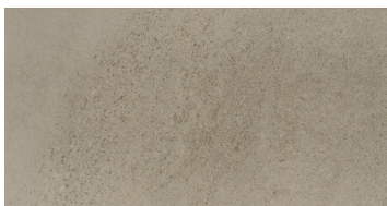
Faro Taupe Grey