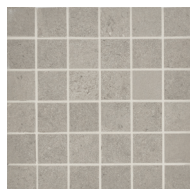
2 × 2 Mosaic Mesh