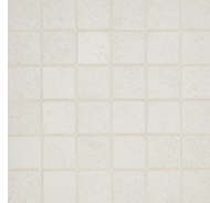
2 × 2 Mosaic Mesh