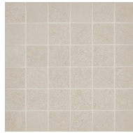
2 × 2 Mosaic Mesh