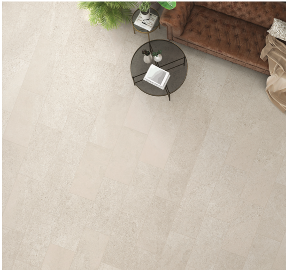
Faro Beige 12 × 24