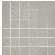
2 × 2 Mosaic Mesh