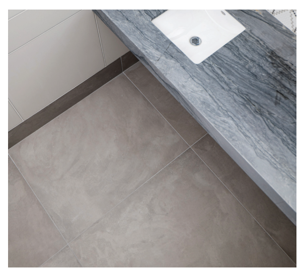
CityLife Ash 36 × 36