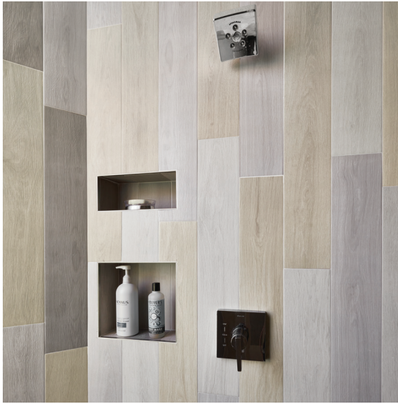
Alpi Chiaro, Crema & Perla