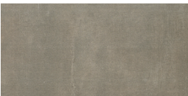
Reside Brown USA