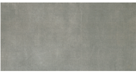
Reside Ash USA