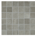
2 x 2 Mosaic Mesh