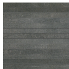
Straight Stack 1 x 12 Mesh