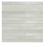
Straight Stack 1 x 12 Mesh