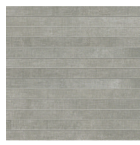
Straight Stack 1 x 12 Mesh