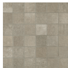
2 x 2 Mosaic Mesh

When installing rectangular or square tiles 15 inches or longer with a staggered joint, it is recommended that the offset should not exceed 33%, unless otherwise specified by the manufacturer.