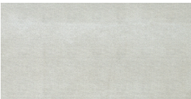
Reside Beige USA