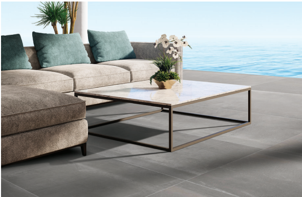
Reside Ash USA 24 x 48 R11 Anti-Slip Finish