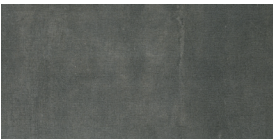
Reside Black USA