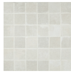
2 x 2 Mosaic Mesh