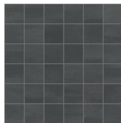
2 × 2 Mosaic Mesh