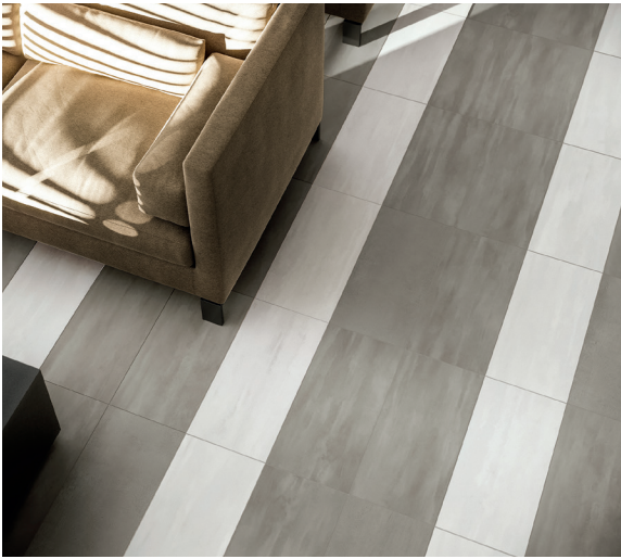
Reflexion Bright & Titanium