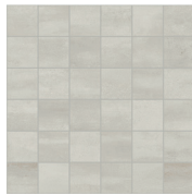
2 × 2 Mosaic Mesh