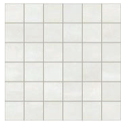
2 × 2 Mosaic Mesh